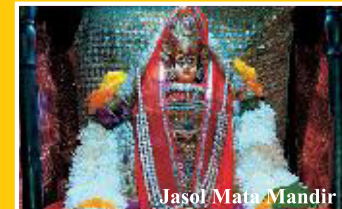
Jasol Mata Mandir