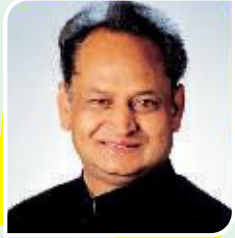
Sh. Ashok Gehlot Chief Minister, Rajasthan